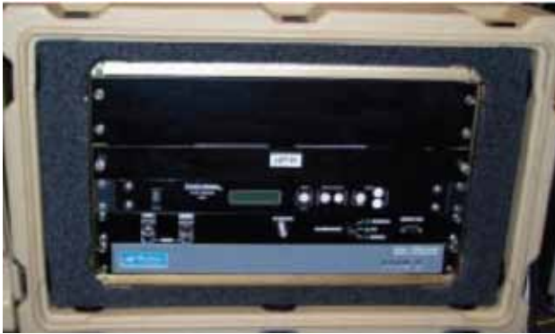
Typical Transit Case with iDirect Modem