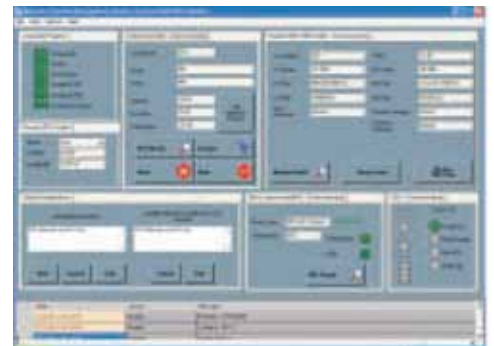
Terminal Management System Overview Screen